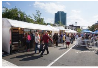
Arts & Crafts on Bedford: This Weekend