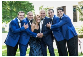
A Family Affair: The First Family of Special Events Hosts a Wedding From the Heart