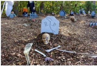
Is Stamford Haunted? You Be the Judge!